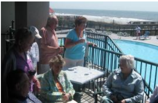
Why We Moved Here