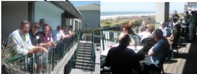
The April Lunch Bunch enjoyed a beautiful day at the beach at the Iles Restaurant in Ocean Isle.