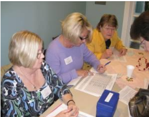
The Lunch Bunch