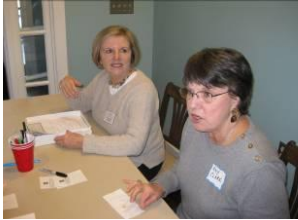
New Members Sign Up Here