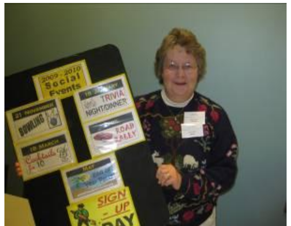
Come On Down