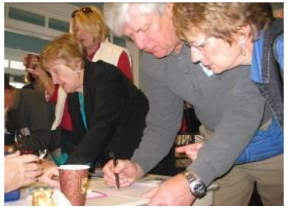
This Way To The Fun