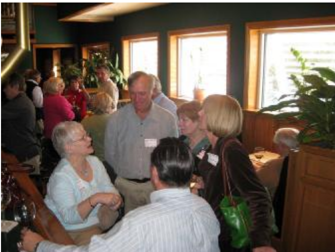
The February Lunch Bunch Enjoys Port City Chop House For Additional Photos Go To: brunswicknewcomers.com

May your blessings outnumber the shamrocks that grow And may trouble avoid you wherever you go.