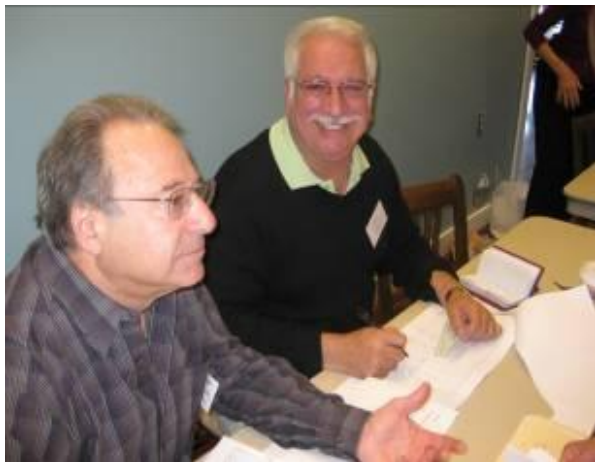
The Travel Guys