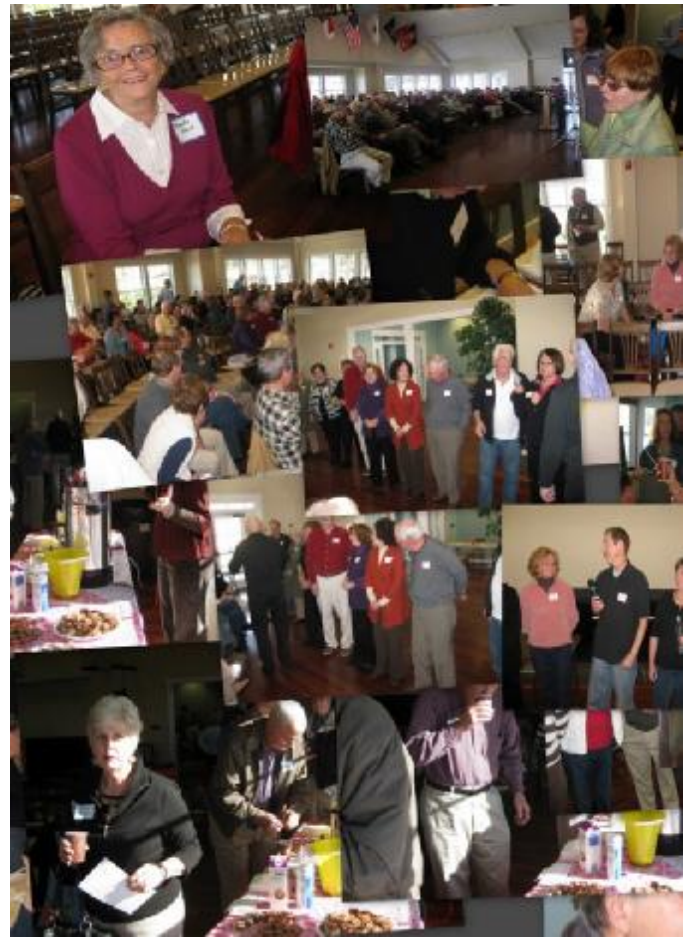
At Least 22 New Members Signed Up At The January Meeting