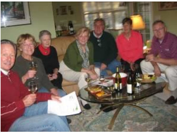
Your Wine Tasting Committee