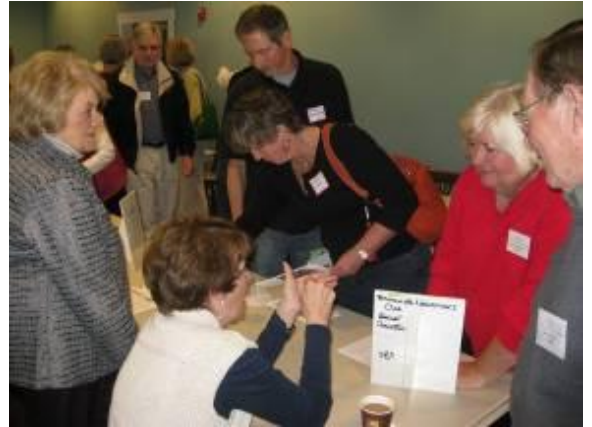
Won't You Please Join My Committee