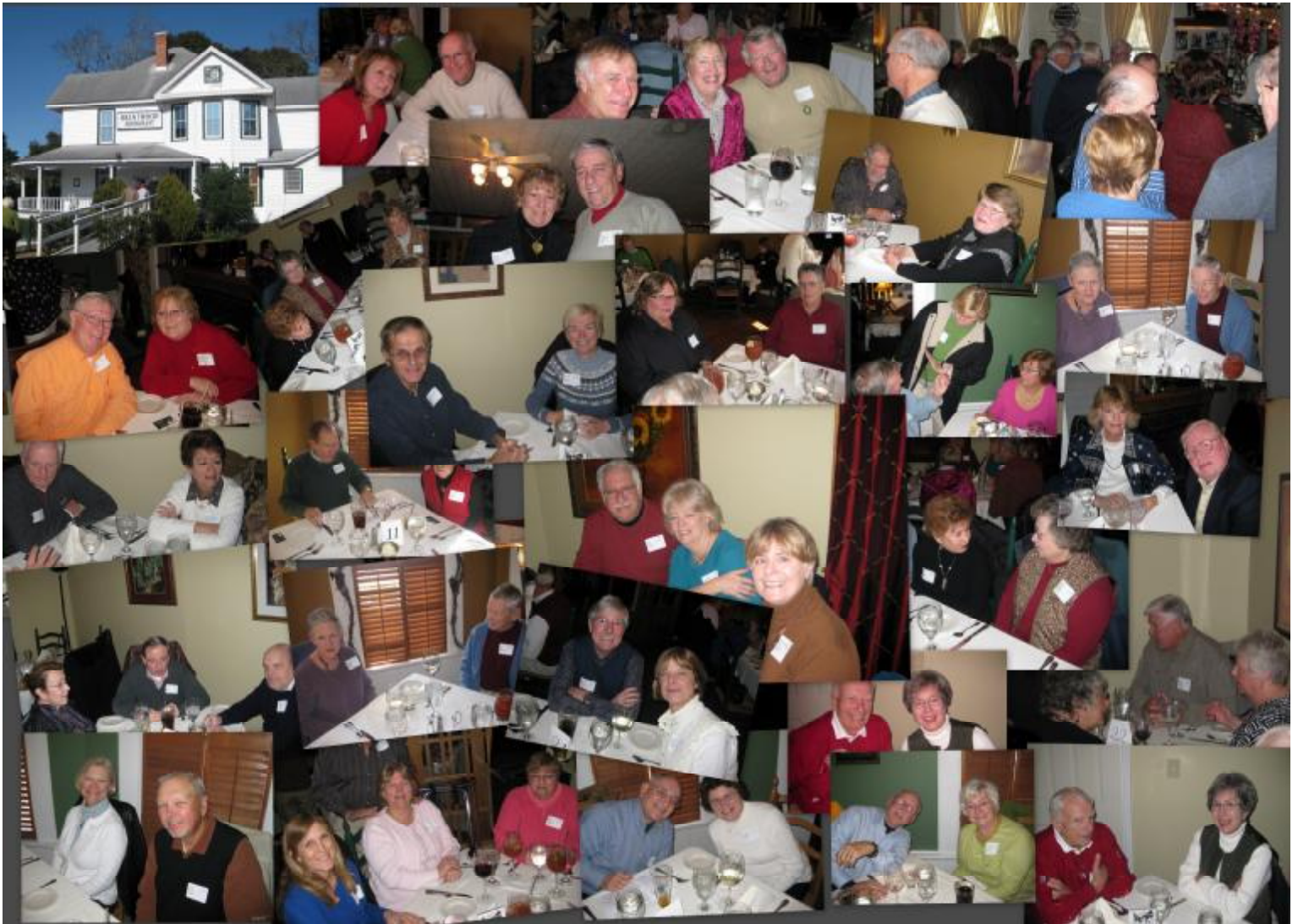
The Lunch Bunch Enjoys Brentwood Restaurant in Little River on A Cold January Day