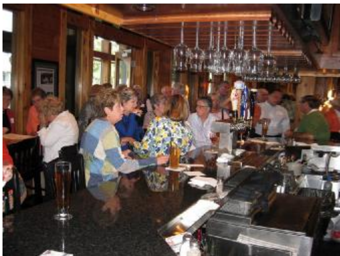
November Lunch Bunchers At Boudry House, Calabash