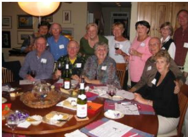
November Tasters Sample Beaujolais Wines From France