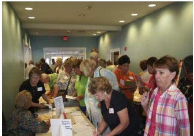
Signing Up For Activities At The Monthly Meeting